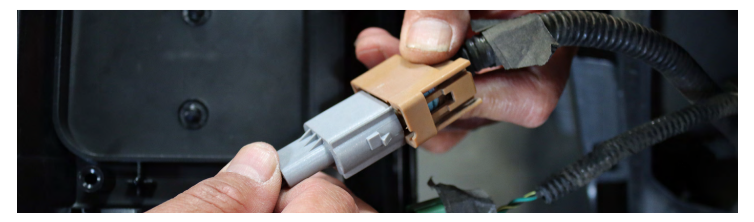
Plug (LIGHT-GREEN) socket to the (BLACK) connector from the new ALPHAREX Tail light

Plug (LIGHT-BROWN) socket to the (GRAY) connector from the new ALPHAREX Tail light